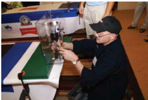
Maintenance Mania participant competes in the toilet repair challenge.

Maintenance Mania® is a national competition sponsored by the National Apartment Association and its affiliates. The twenty maintenance technicians with the best times nationally compete for the title of Best Maintenance Technician during NAA's convention.