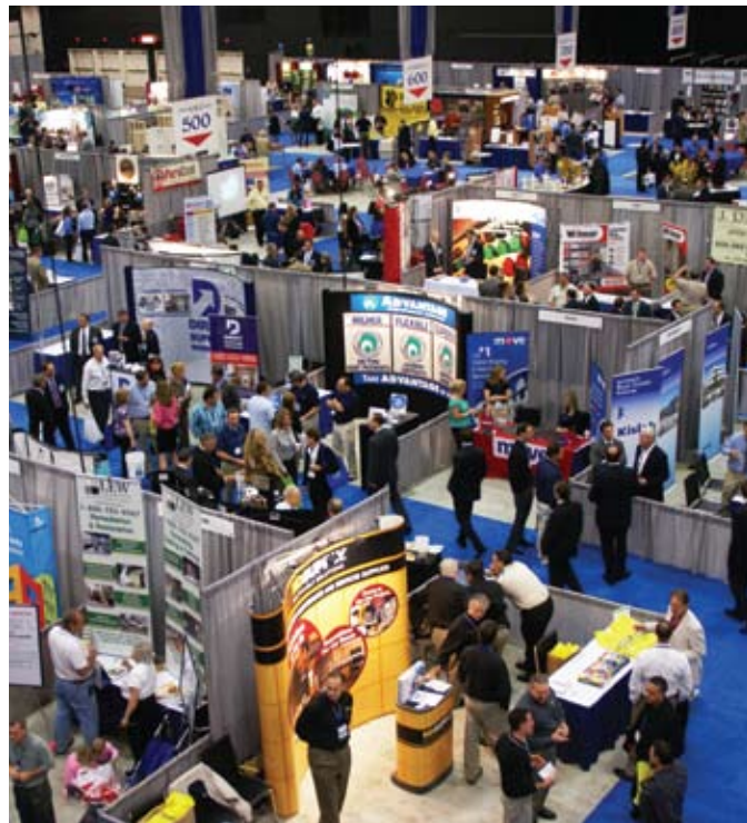
NJAA's conference and expo drew over 1,200 attendees and 181 exhibitors