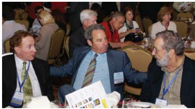
Members enjoying the conference luncheon