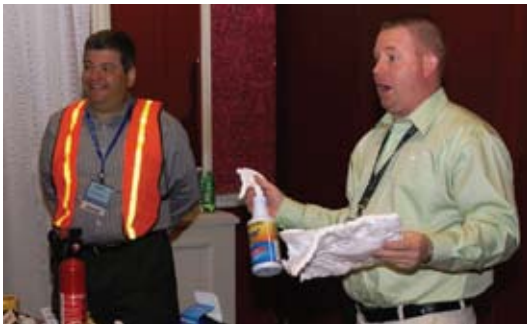
Educational offerings at the conference & expo covered a variety of topics.